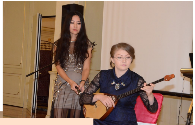
Welcome Dinner party in the honour of MPP 2014 class